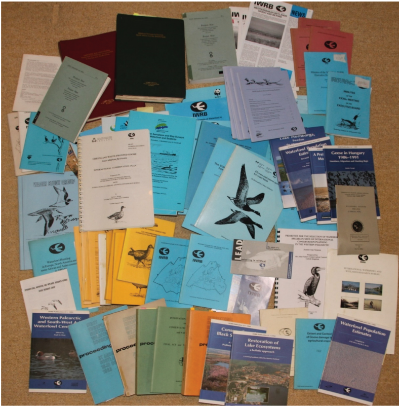
Just a very small selection of IWRB's prodigious output of publications from 1952 to 1995.