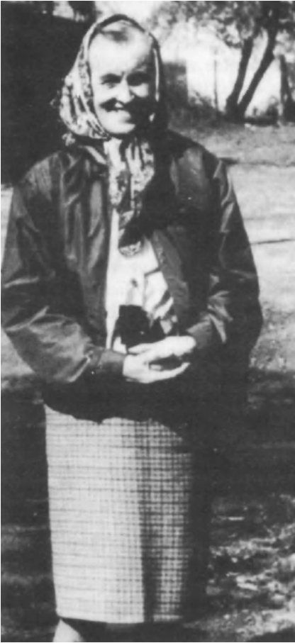
Figure S1. Phyllis Barclay-Smith CBE.