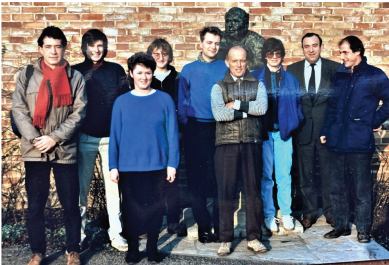
Figure S3b. IWRB Headquarters staff, c. 1989.