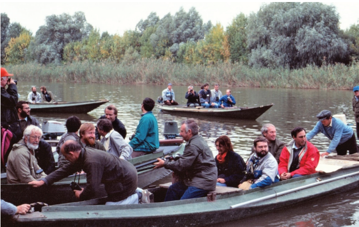
Figure S8. Start of the Volga Delta excursion following the 34th Board meeting in Astrakhan, September 1989.