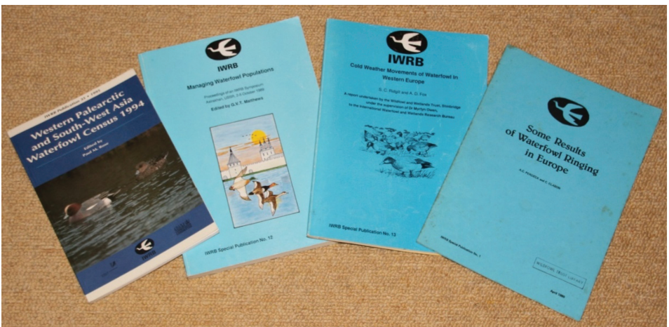
The evolving house style of IWRB's main publication series.