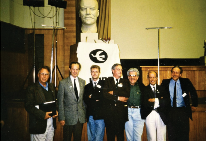
Figure S7. Participants of the IWRB Conference in Astrakhan, Russian Federation, September 1989.