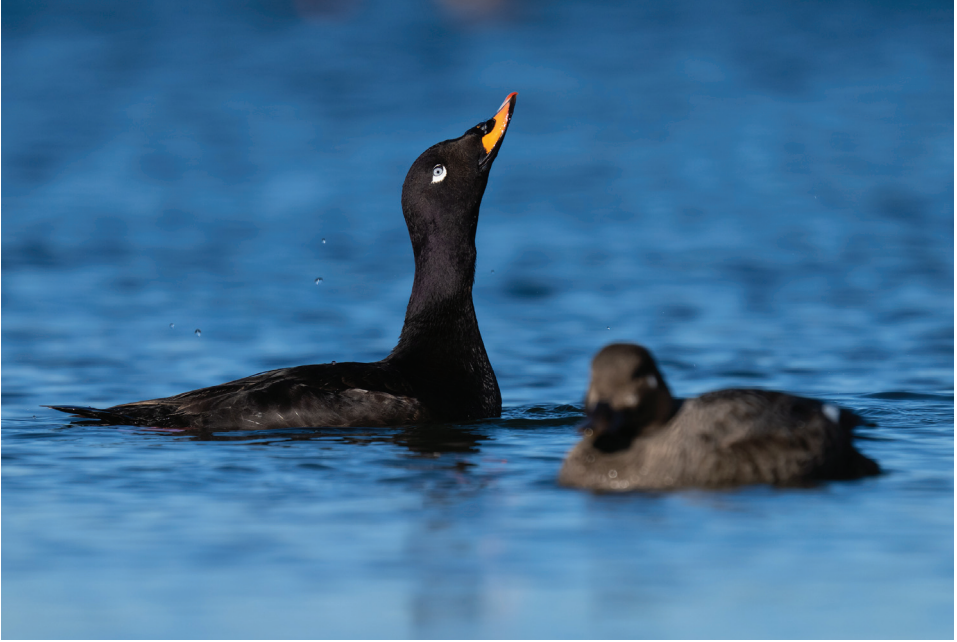
Photograph: Proud male! Velvet Scoter displaying to a female at Lake Tabatskuri, Georgia, by Oksana Bystritskaia.