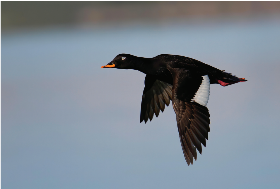
Photograph: Velvet Scoter in flight.