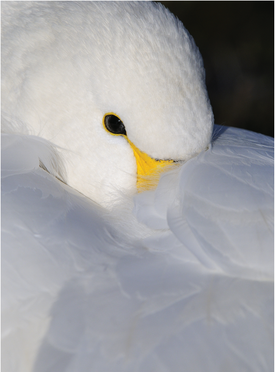
Photograph: Bewick's Swan resting with beak tucked under wing at Slimbridge, Gloucestershire, England in December, by Malcolm Schuy/FLPA.