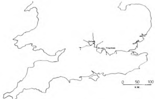
Fig. 1. Map of Southern England showing location of Thames study area between Lechlade and Richmond.

Carcasses of Mute Swans were collected from throughout England for analysis at the Sutton Bonington Veterinary Investigation Centre. From 1980 up to 1985 initial surveys covered as wide a geographical area as possible. Since 1985 effort has been concentrated on birds from the Midlands and the Thames valley, although swans from other areas were still examined. A detailed investigation into lead poisoning amongst swans inhabiting the Thames valley in Southern England was initiated in 1979 (Birkhead 1982) and continued from 1982 to the present (Sears 1986, 1988, in prep.). The principal area of study was the River Thames between Lechlade, Gloucestershire (51°41'N 1°41'W) and Richmond, Surrey (51°27'N 0°18'W), some of its tributaries and gravel pits within 5 km of the river (Fig. 1). The flock of swans at Windsor on the River Thames (51°29'N