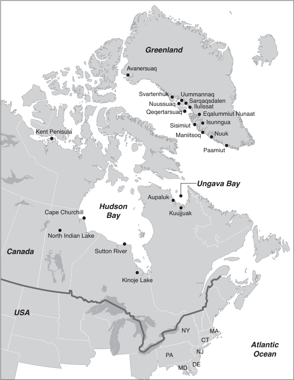
Figure 1. Map showing the locations of places, U.S. states (identified by conventional two letter abbreviations) and regions mentioned in the text.